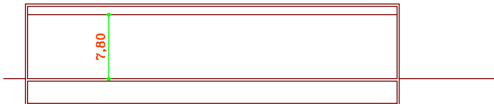
coupe B-B éch. 1/500